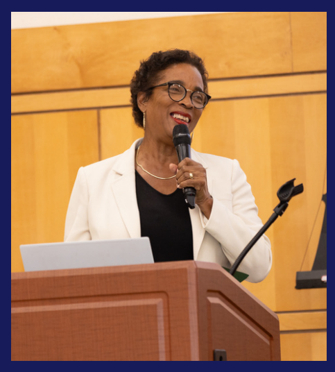
2024- Hon Minister Sandra Husbands