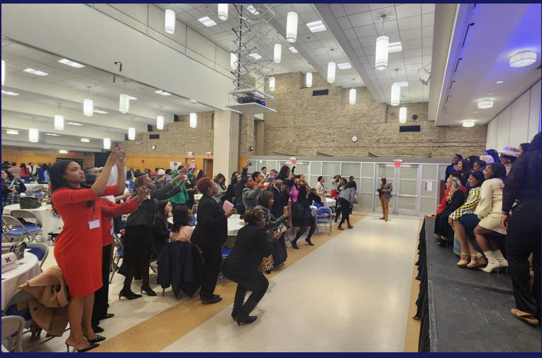
2024 Attendees- 300+