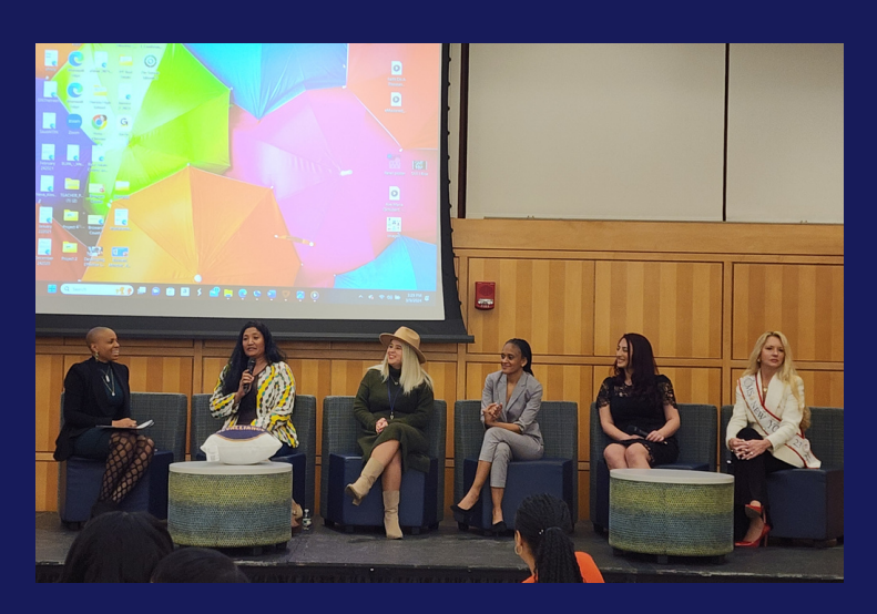
A Panel Discusion